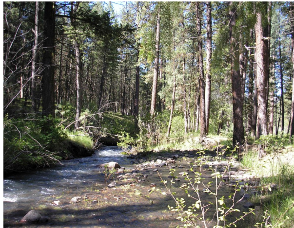
The McKenzie River in Oregon's Cascade Range is supported by a substantial groundwater component